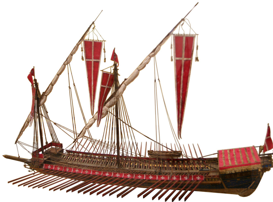
Galley of the Order of the Knights of St. John