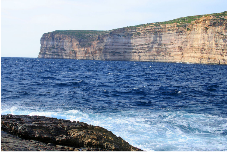
Cliffs of Gozo