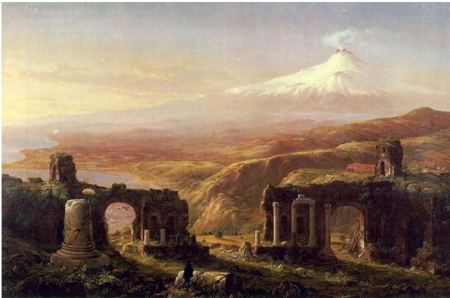
< Mount Etna as seen from the Greco-Roman Theatre in Taormina on a painting by Thomas Cole

Full-day excursion to Catania and Taormina. We first motor to Catania, the island's biggest city after Palermo, for a walking tour of the historical centre and the amazing fish market. Continue along the rugged coastline, associated with Homer's story of Ulysses, to the idyllic resort of Taormina, spectacularly situated on a rocky plateau, featuring wonderful views of Mount Etna and the sea as far as the coast of Calabria, the tip of the Italian "boot"! Taormina is featured on UNESCO's tentative list of world heritage sites ( http://whc.unesco.org/en/tentativelists/1164 ). Our walking tour will include a visit to the amazing Greco-Roman Theatre. Return to Syracuse in late afternoon. Today, lunch OR dinner will be included.