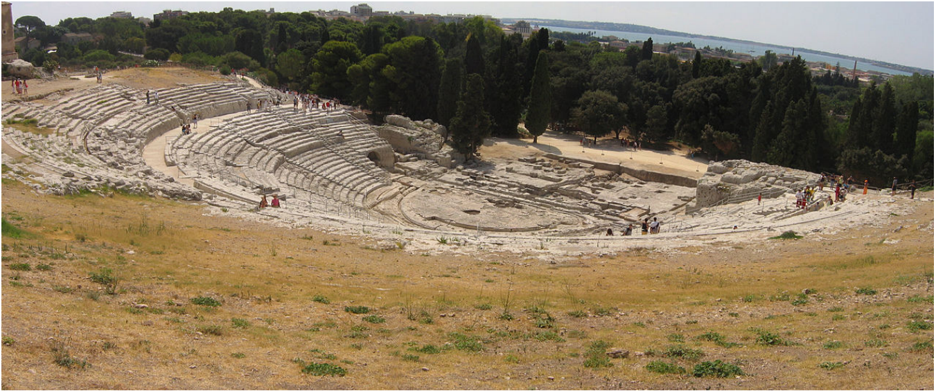
Syracuse's Greek Theatre